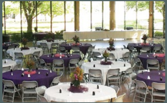
weddings & parties up to 350 people

4 - Hour Decorating Time 5 - Hour Event from 6pm-11pm 1 - Hour Clean-Up from 11pm-Midnight