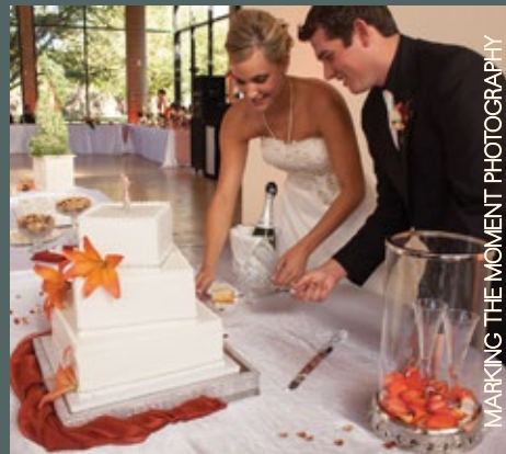
MARKING THE MOMENT PHOTOGRAPHY

Looking for a spacious, versatile, one-of-a-kind venue for your big day? The MAAIC offers a picturesque ambiance & gorgeous view of the Keeper of the Plains and downtown Wichita. We give you the flexibility to use the catering company & bar service of your choice as well as provide onsite security guards & set up/tear down assistance. MAAIC is the perfect venue for your big event